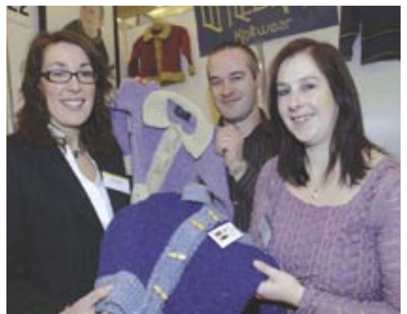
Kelly Knitwear @ The Meet The Buyer Event